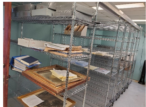
Rolling Shelving Annex B

As mentioned, grants were applied for as they became available. To date, we have received the following: OTF Resilient Communities Fund for $17,000; Middlesex Centre Municipal Grant for $5000; Canada Heritage Grant for $5000 as well as the Covid Rent Subsidy. We continue to monitor and apply for all grants that may be applicable to MCA.