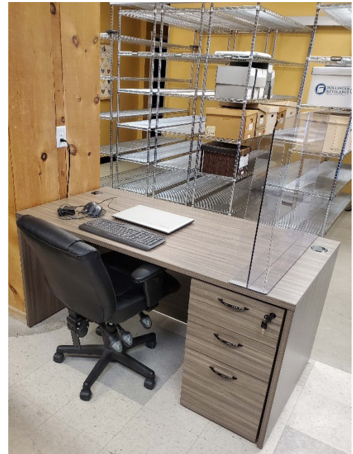
New Desk, Chair and Rolling Shelving Annex A

Even though we were closed, a lot has happened. Many collections continued to arrive and are being processed by our archivist and volunteers. New rolling shelves were installed in Annexes A and B with thanks to Ontario Trillium Foundation (OTF) Resilient Communities Fund and Municipality of Middlesex Centre Grants. From the OTF Resilient Communities Fund, desks and chairs for Annexes A and B, and archival supplies were also purchased. The Covid rent supplement helped alleviate some rent expenses. The Ilderton Library donated shelving that added much needed space to the Ken Veldhuis Reading Room in the Archives. Upon its closure, Vanneck United Church donated tables and chairs that makes processing in Annexes A and B much easier.