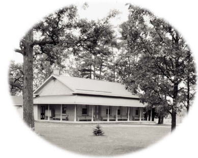
Selma Meeting House (Selma) - Coldstream

We do wish to recognise the generous donations of our local Lions Clubs in Delaware, Poplar Hill and Ilderton as well as Town and Country Mutual Insurance Company. Private and memorial donations have also been received. Because we must raise funds through grants or donations, we are constantly working to keep our income and expense columns balanced.